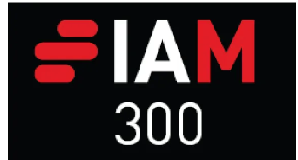
World Top 300 IP Strategies 2023