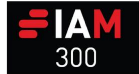
World Top 300 IP Strategies 2025